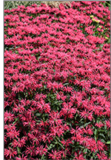
Upscale Red Velvet Beebalm flowers

Upscale Red Velvet Beebalm will grow to be about 3 feet tall at maturity, with a spread of 3 feet. When grown in masses or used as a bedding plant, individual plants should be spaced approximately 3 feet apart. It grows at a fast rate, and under ideal conditions can be expected to live for approximately 5 years. As an herbaceous perennial, this plant will usually die back to the crown each winter, and will regrow from the base each spring. Be careful not to disturb the crown in late winter when it may not be readily seen!