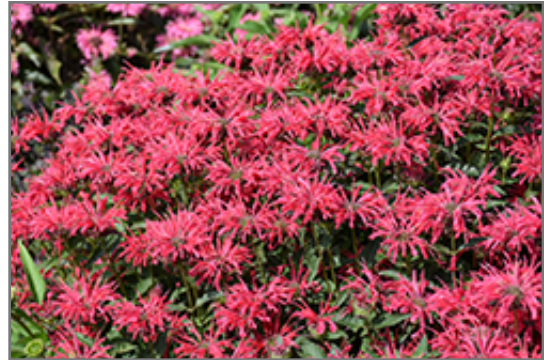
Upscale Red Velvet Beebalm flowers