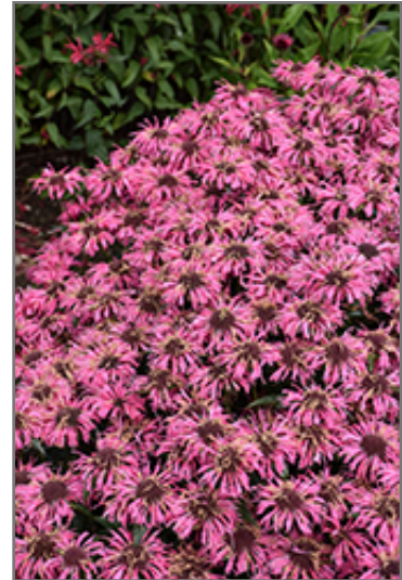
Upscale Pink Chenille Beebalm flowers

This plant will require occasional maintenance and upkeep, and should be cut back in late fall in preparation for winter. It is a good choice for attracting bees, butterflies and hummingbirds to your yard, but is not particularly attractive to deer who tend to leave it alone in favor of tastier treats. Gardeners should be aware of the following characteristic(s) that may warrant special consideration;