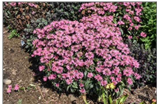
Upscale Pink Chenille Beebalm in bloom