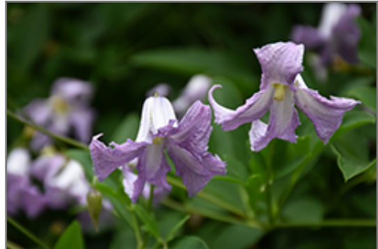
Betty Corning Clematis flowers

Betty Corning Clematis is recommended for the following landscape applications;