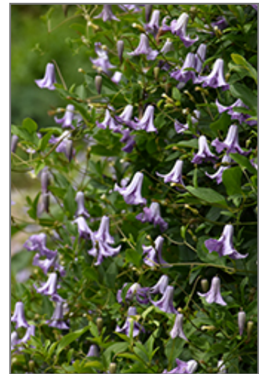
Betty Corning Clematis flowers