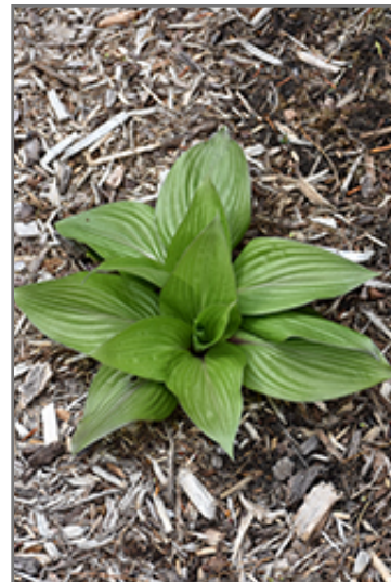
First Blush Hosta