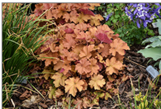
Dolce Toffee Tart Coral Bells

Dolce Toffee Tart Coral Bells is recommended for the following landscape applications;