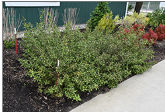
Vinho Verde Weigela