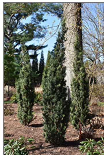
Stonehenge Skinny Yew