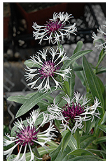
Amethyst In Snow Cornflower flowers