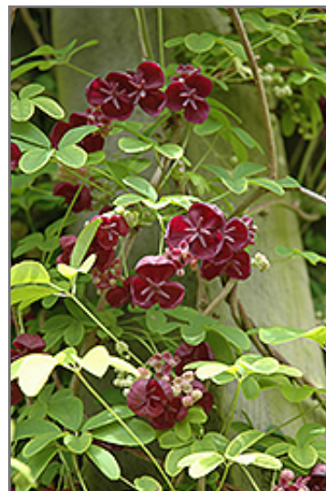
Fiveleaf Akebia flowers