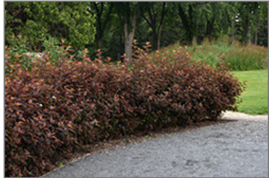
Center Glow Ninebark

This shrub does best in full sun to partial shade. It is very adaptable to both dry and moist locations, and should do just fine under average home landscape conditions. It is not particular as to soil type or pH. It is highly tolerant of urban pollution and will even thrive in inner city environments. This is a selection of a native North American species.