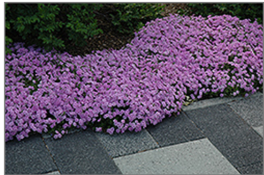
Fort Hill Moss Phlox in bloom