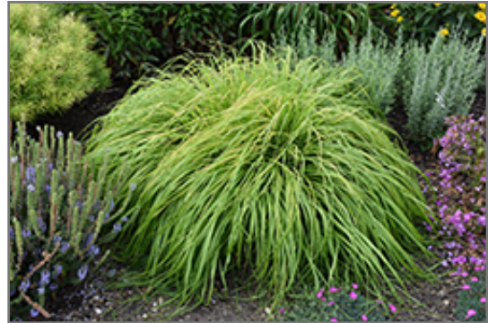
Prairie Winds Lemon Squeeze Fountain Grass

This is a relatively low maintenance plant, and is best cleaned up in early spring before it resumes active growth for the season. Deer don't particularly care for this plant and will usually leave it alone in favor of tastier treats. It has no significant negative characteristics.