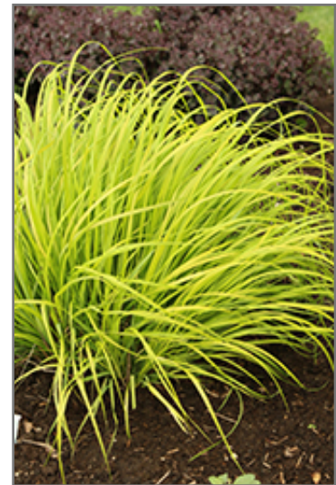
Prairie Winds Lemon Squeeze Fountain Grass