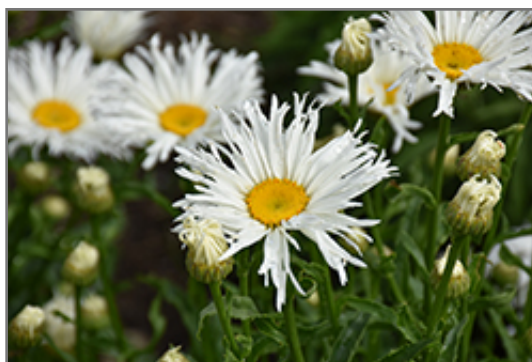
Amazing Daisies Spun Silk Shasta Daisy flowers

Amazing Daisies Spun Silk Shasta Daisy is recommended for the following landscape applications;