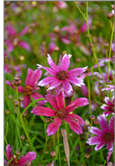
Satin & Lace Razzle Dazzle Tickseed flowers