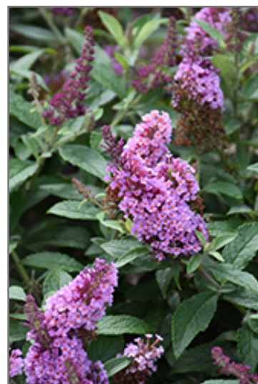
Chrysalis Pink Butterfly Bush flowers