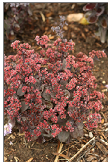
Rock 'N Grow Back in Black Stonecrop flowers

Rock 'N Grow Back in Black Stonecrop is a fine choice for the garden, but it is also a good selection for planting in outdoor pots and containers. With its upright habit of growth, it is best suited for use as a 'thriller' in the 'spiller-thriller-filler' container combination; plant it near the center of the pot, surrounded by smaller plants and those that spill over the edges. Note that when growing plants in outdoor containers and baskets, they may require more frequent waterings than they would in the yard or garden. Be aware that in our climate, most plants cannot be expected to survive the winter if left in containers outdoors, and this plant is no exception. Contact our experts for more information on how to protect it over the winter months.