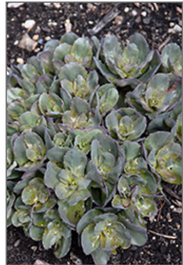
Rock 'N Grow Back in Black Stonecrop foliage