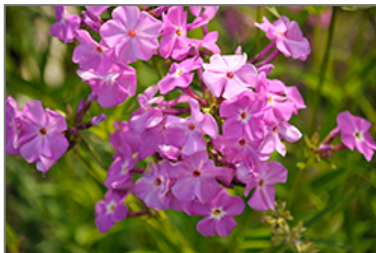
Opening Act Romance Phlox flowers

Opening Act Romance Phlox is recommended for the following landscape applications;