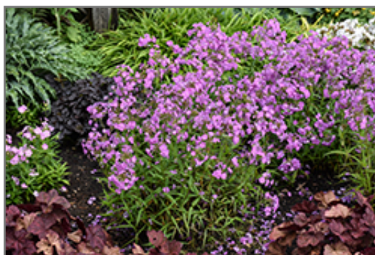
Opening Act Romance Phlox in bloom