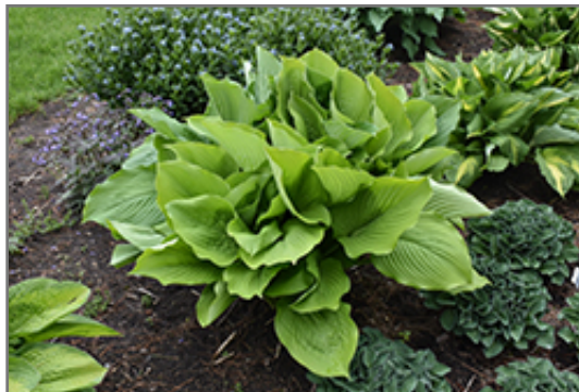
Age of Gold Hosta