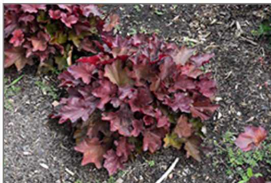
Carnival Burgundy Blast Coral Bells

Carnival Burgundy Blast Coral Bells will grow to be about 12 inches tall at maturity, with a spread of 14 inches. When grown in masses or used as a bedding plant, individual plants should be spaced approximately 12 inches apart. Its foliage tends to remain dense right to the ground, not requiring facer plants in front. It grows at a medium rate, and under ideal conditions can be expected to live for approximately 10 years. As an evergreen perennial, this plant will typically keep its form and foliage year-round.