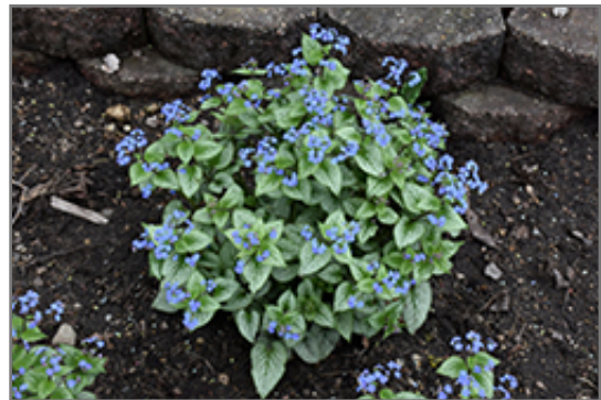
Sterling Silver Bugloss in bloom