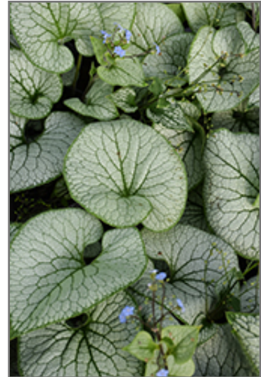
Sterling Silver Bugloss foliage

Sterling Silver Bugloss is a fine choice for the garden, but it is also a good selection for planting in outdoor pots and containers. It is often used as a 'filler' in the 'spiller-thriller-filler' container combination, providing a mass of flowers and foliage against which the thriller plants stand out. Note that when growing plants in outdoor containers and baskets, they may require more frequent waterings than they would in the yard or garden. Be aware that in our climate, most plants cannot be expected to survive the winter if left in containers outdoors, and this plant is no exception. Contact our experts for more information on how to protect it over the winter months.