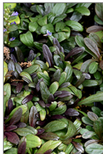
Feathered Friends Noble Nightingale Bugleweed foliage