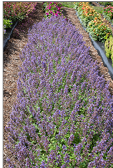
Whispurr Blue Catmint in bloom