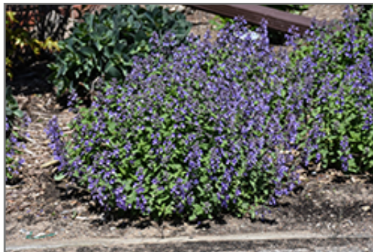
Picture Purrfect Catmint in bloom