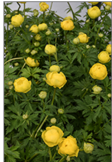
Lemon Queen Globeflower flowers