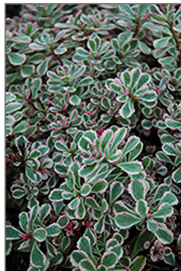
Tricolor Stonecrop foliage

Tricolor Stonecrop is recommended for the following landscape applications;