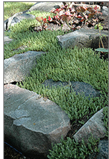
Six Row Stonecrop