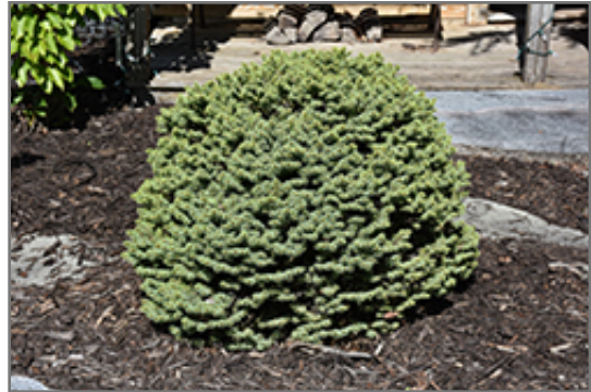
Dwarf Serbian Spruce