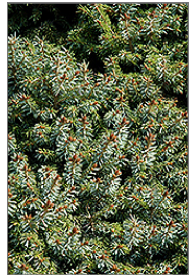
Dwarf Serbian Spruce foliage