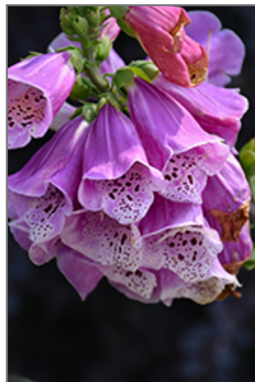
Excelsior Group Foxglove flowers