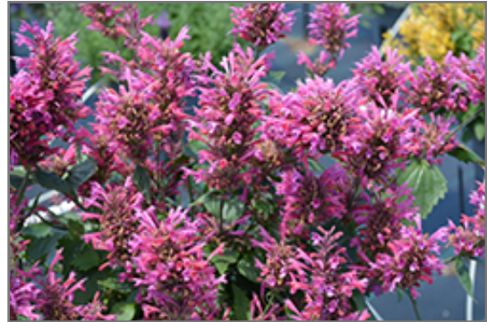
Morello Hyssop flowers

Morello Hyssop is recommended for the following landscape applications;