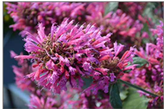
Morello Hyssop flowers