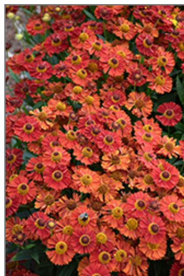
Mariachi Ranchera Sneezeweed flowers

Mariachi Ranchera Sneezeweed is recommended for the following landscape applications;