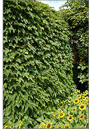
Boston Ivy

This woody vine does best in full sun to partial shade. It is very adaptable to both dry and moist locations, and should do just fine under average home landscape conditions. It is considered to be drought-tolerant, and thus makes an ideal choice for xeriscaping or the moisture-conserving landscape. It is not particular as to soil type or pH, and is able to handle environmental salt. It is highly tolerant of urban pollution and will even thrive in inner city environments. This species is not originally from North America.