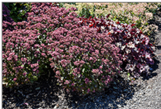
Double Martini Stonecrop in bloom

Double Martini Stonecrop will grow to be about 15 inches tall at maturity, with a spread of 18 inches. When grown in masses or used as a bedding plant, individual plants should be spaced approximately 16 inches apart. It grows at a fast rate, and under ideal conditions can be expected to live for approximately 15 years. As an herbaceous perennial, this plant will usually die back to the crown each winter, and will regrow from the base each spring. Be careful not to disturb the crown in late winter when it may not be readily seen!