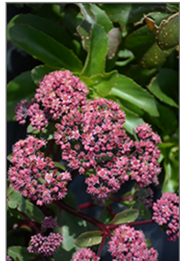
Double Martini Stonecrop flowers