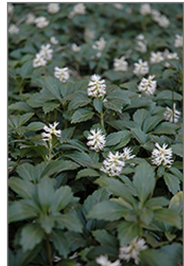
Japanese Spurge flowers