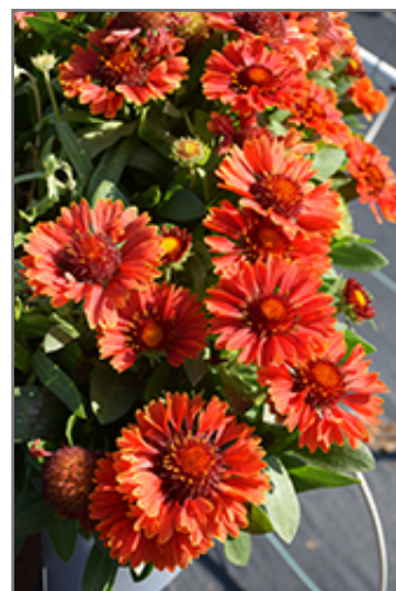
SpinTop Yellow Touch Blanket Flower flowers

SpinTop Yellow Touch Blanket Flower is recommended for the following landscape applications;