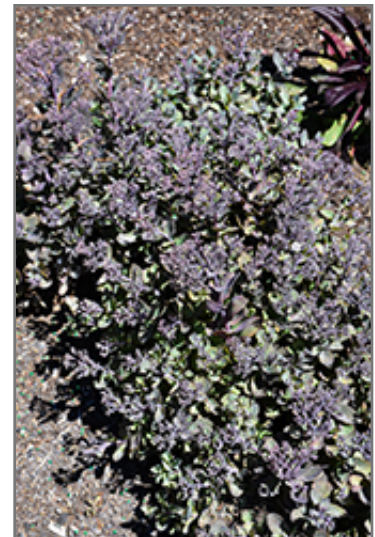
Dynomite Stonecrop in bloom