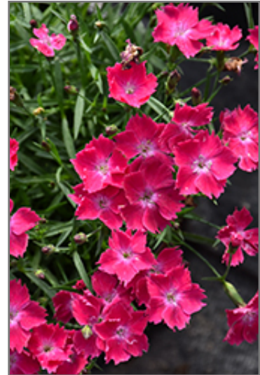
Beauties Kahori Scarlet Pinks flowers

Beauties Kahori Scarlet Pinks is recommended for the following landscape applications;