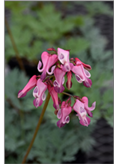
Pink Diamonds Fern-leaved Bleeding Heart flowers

Pink Diamonds Fern-leaved Bleeding Heart is a fine choice for the garden, but it is also a good selection for planting in outdoor pots and containers. It is often used as a 'filler' in the 'spiller-thriller-filler' container combination, providing a mass of flowers and foliage against which the thriller plants stand out. Note that when growing plants in outdoor containers and baskets, they may require more frequent waterings than they would in the yard or garden. Be aware that in our climate, most plants cannot be expected to survive the winter if left in containers outdoors, and this plant is no exception. Contact our experts for more information on how to protect it over the winter months.