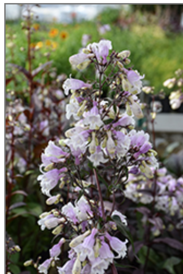
Pocahontas Beard Tongue flowers

Pocahontas Beard Tongue is recommended for the following landscape applications;