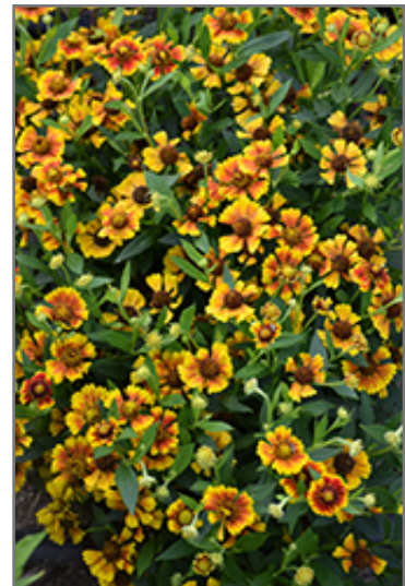
Salud Embers Sneezeweed flowers