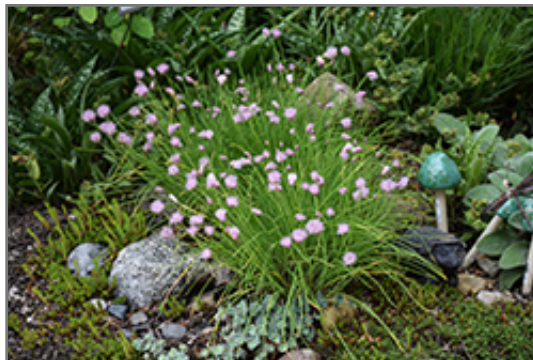
Rising Star Chives in bloom