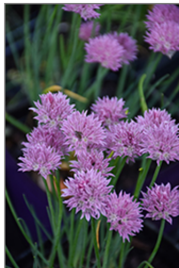
Rising Star Chives flowers