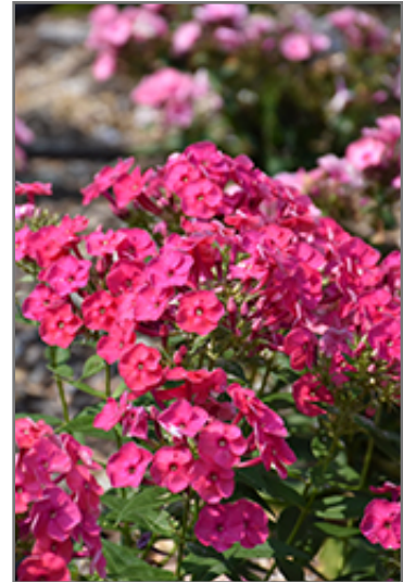
Ka-Pow Pink Garden Phlox flowers

Ka-Pow Pink Garden Phlox is recommended for the following landscape applications;