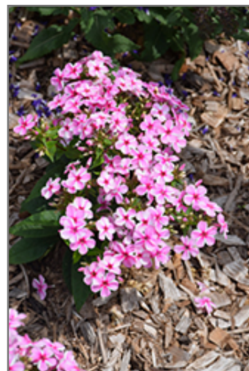
Early Pink Candy Garden Phlox flowers