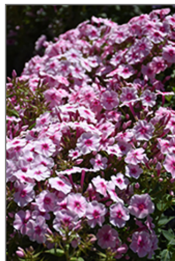
Early Pink Candy Garden Phlox flowers

Early Pink Candy Garden Phlox is recommended for the following landscape applications;