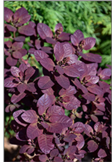
Velveteeny Purple Smokebush foliage

Velveteeny Purple Smokebush makes a fine choice for the outdoor landscape, but it is also well-suited for use in outdoor pots and containers. With its upright habit of growth, it is best suited for use as a 'thriller' in the 'spiller-thriller-filler' container combination; plant it near the center of the pot, surrounded by smaller plants and those that spill over the edges. It is even sizeable enough that it can be grown alone in a suitable container. Note that when grown in a container, it may not perform exactly as indicated on the tag - this is to be expected. Also note that when growing plants in outdoor containers and baskets, they may require more frequent waterings than they would in the yard or garden. Be aware that in our climate, most plants cannot be expected to survive the winter if left in containers outdoors, and this plant is no exception. Contact our experts for more information on how to protect it over the winter months.