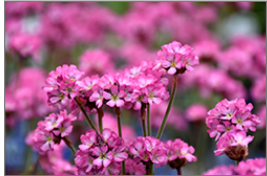
Vesuvius Black-leaved Sea Thrift flowers

Vesuvius Black-leaved Sea Thrift is recommended for the following landscape applications;