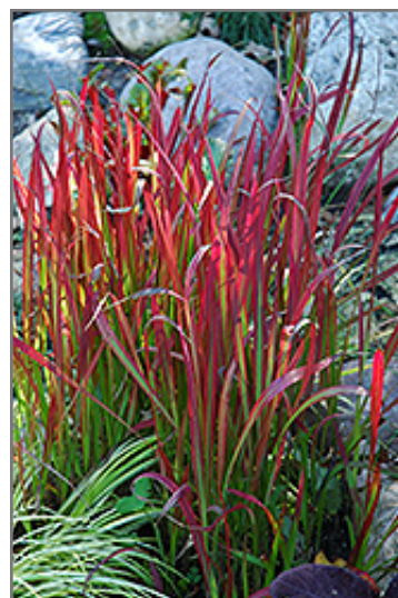
Red Baron Japanese Blood Grass

Red Baron Japanese Blood Grass is a fine choice for the garden, but it is also a good selection for planting in outdoor pots and containers. With its upright habit of growth, it is best suited for use as a 'thriller' in the 'spiller-thriller-filler' container combination; plant it near the center of the pot, surrounded by smaller plants and those that spill over the edges. Note that when growing plants in outdoor containers and baskets, they may require more frequent waterings than they would in the yard or garden. Be aware that in our climate, most plants cannot be expected to survive the winter if left in containers outdoors, and this plant is no exception. Contact our experts for more information on how to protect it over the winter months.