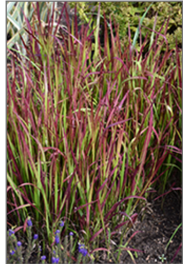
Red Baron Japanese Blood Grass foliage