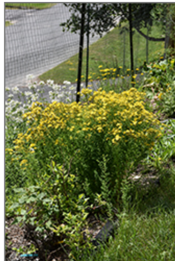
St. John's Wort in bloom