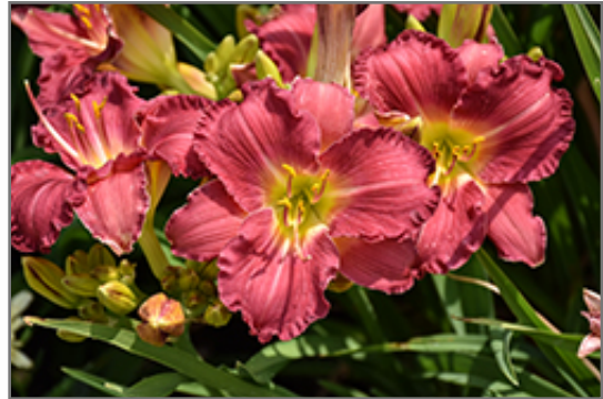
Happy Ever Appster Romantic Returns Daylily flowers