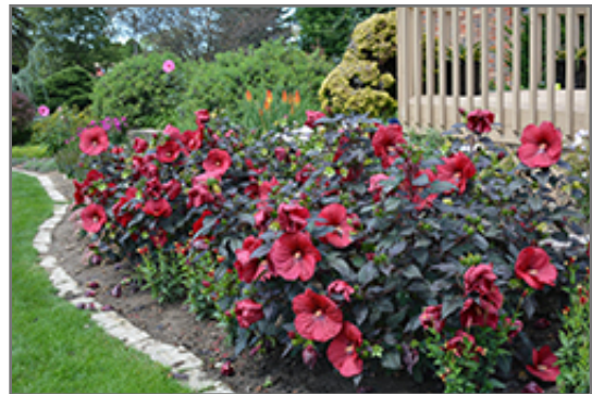
Summerific Holy Grail Hibiscus in bloom