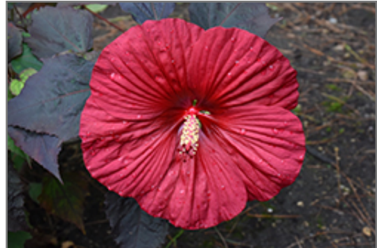
Summerific Holy Grail Hibiscus flowers