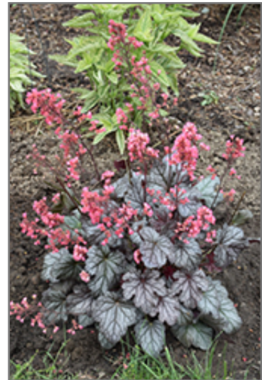
Timeless Treasure Coral Bells in bloom