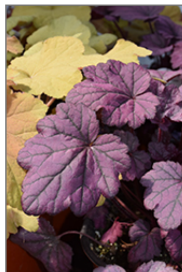
Electric Plum Coral Bells foliage